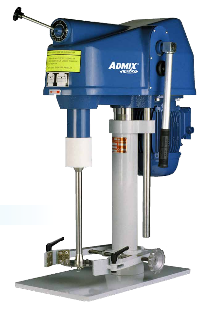
Diaf Minibatch 20VH model