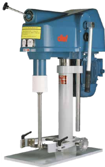
Diaf Minibatch 20VH model

The Dissolver provides fast and excellent dispersion throughout the different process steps, it is extremely effective allowing short batch times and a higher total production capacity. The Dissolver models are available in both totally enclosed, with fan-cooled motor and explosion proof configurations.