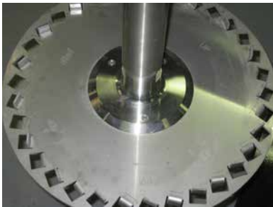
Sawtooth dispersion discs