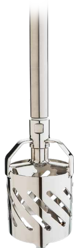
Rotosolver® high shear disperser