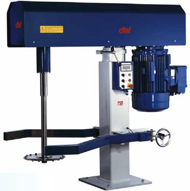
Diaf Dissolver 1200ZH

The Dissolver provides fast and excellent dispersion throughout the different process steps, it is extremely effective allowing short batch times and a higher total production capacity. The Dissolver models are available in both totally enclosed, with fan-cooled motor and explosion proof configurations.