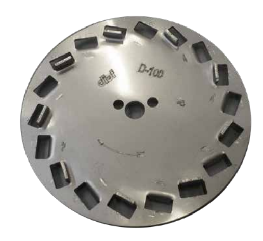
Sawtooth dispersion disc