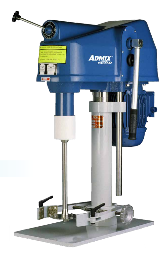
Diaf Minibatch 20VH model