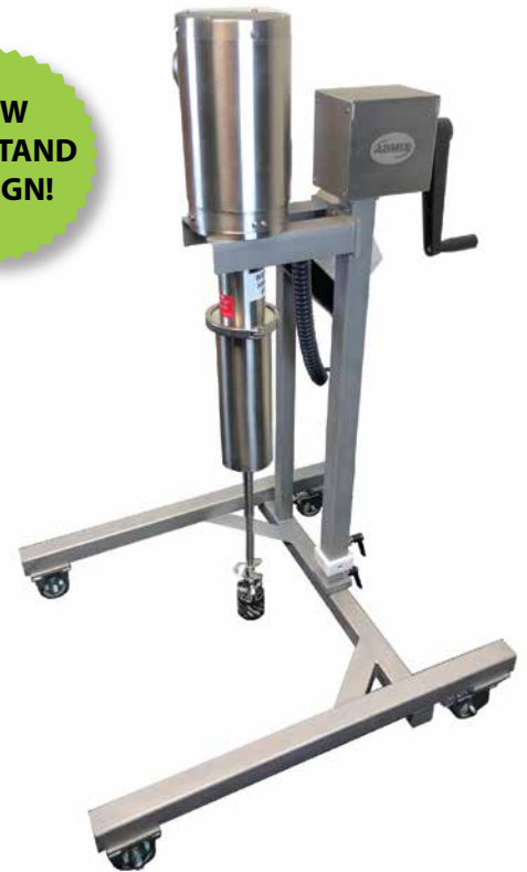
ROTSOLVER® head for RS-02