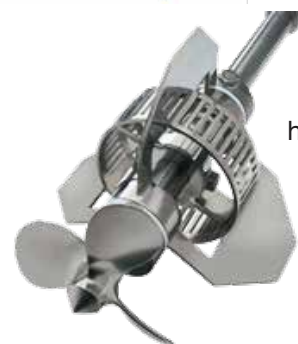
ROTOSTAT® head for XP-02