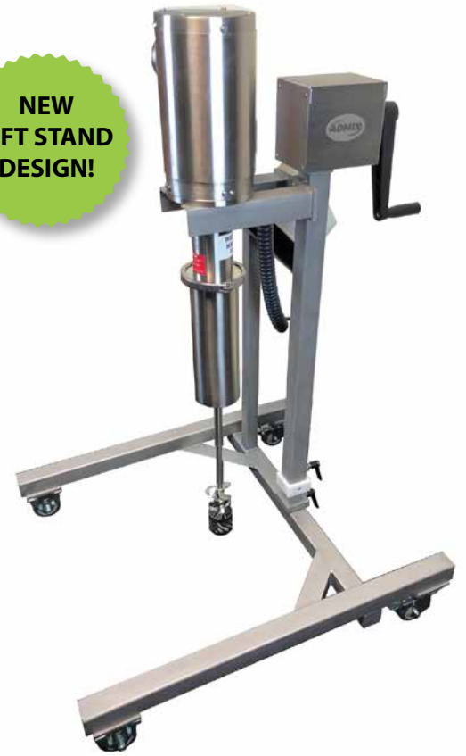
ROTSOLVER® head for RS-02