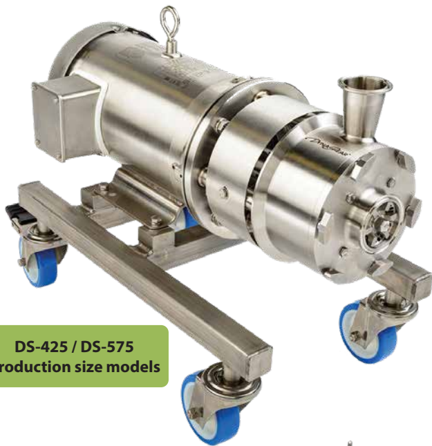
DS-425 / DS-575 production size models

The Dynashear represents the latest technology for sanitary inline continuous processing, or batch processing with recirculation. The Dynashear will mix, dissolve, deagglomerate, disperse, and emulsify a wide range of fluids and semifluids, and is particularly effective for wetting out powders into a liquid. It features a first-in-class tandem head design combining the benefits of both an axial and a radial stage, creating excellent shear and flow characteristics. The result is droplet size reduction as low as 2 - 3 microns and a very narrow distribution, plus flow capacities that are substantially higher than existing inline mixers.