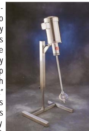
Rotostat® Model XP-02 Pilot Plant High Shear Mixer

We find that for most lower viscosity mixing applications, scaling from a ½ gallon (2 liter) beaker direct to a larger 100 to 200 gallon production vessel is safely and accurately accomplished using the methods above. For moderate to high viscosity fluids, or where production batches exceed 250 gallons, we highly recommend an intermediate step in the scale-up process. Typically, this would be a 5 to 10 gallon batch size, which we make available as our "pilot plant" models, available at our lab facility or at our customer's location through our regional offices. In extreme cases where we are working with both a high viscosity product and a production volume greater than 750 gallons, an additional scale-up test as large as 100 to 150 gallons is recommended. While 3 smaller scale tests may seem excessive and time consuming, it is a small price to pay for insuring 100% accuracy and scalability in the larger, substantially more expensive full scale production vessel.