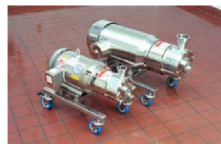
DynaShear™ Sanitary In-Line High Shear Mixers

Closed loop continuous flow in-line mixers, as well as those used to recirculate through a batch process, are becoming extremely useful and successful in sanitary processing. In-line high shear mixers are very fast, provide very consistent results, and are very easy to add on to an existing process or production line.