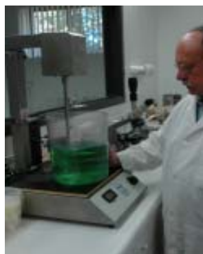
One Gallon Benchtop for Initial Scale

Tank Turnover is a measure of how effective a mixer's pumping rate is relative to turning a batch over a particular number of times a minute. In order to make this